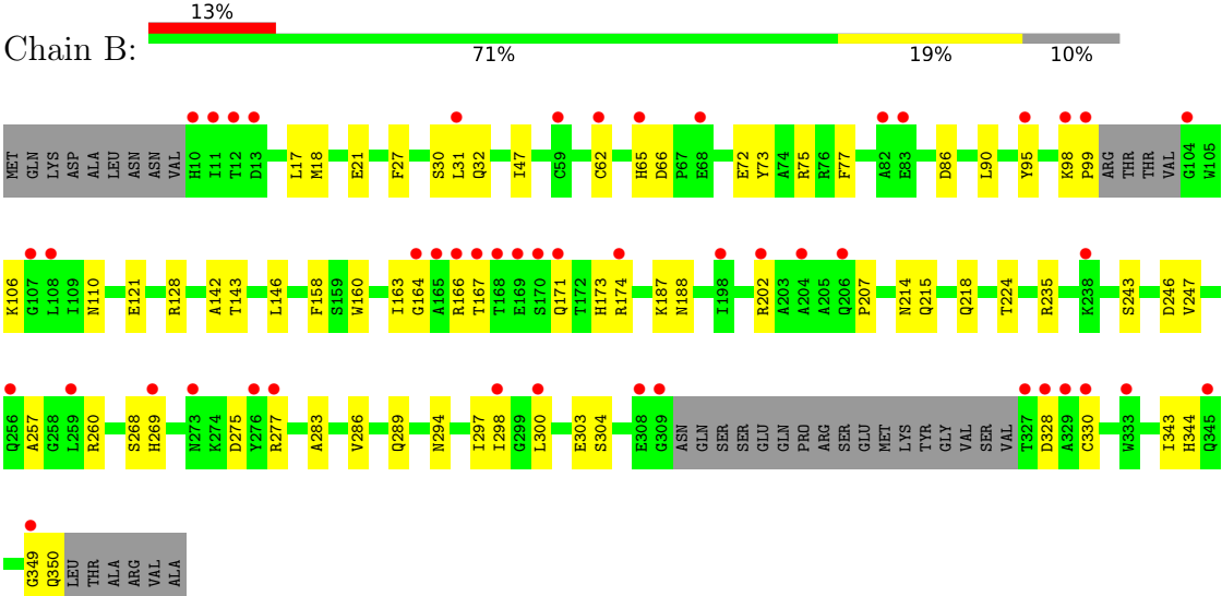
• Molecule 1: Phospho-2-dehydro-3-deoxyheptonate aldolase, Tyr-sensitive